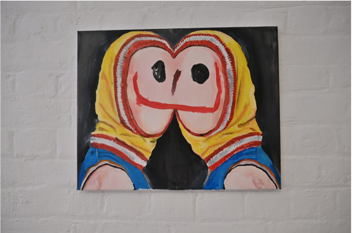
double me, 50 x 40