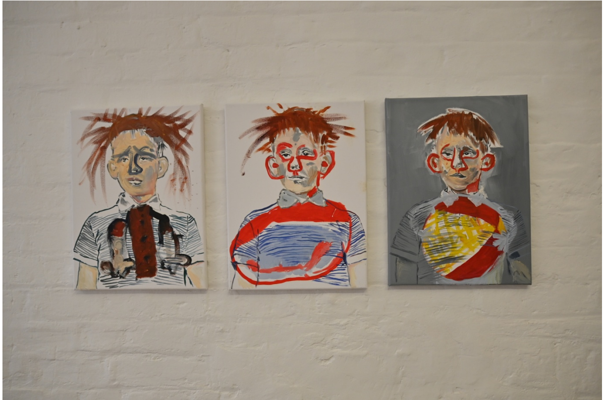
sugar diet (triptych), 3 x 40 x 30