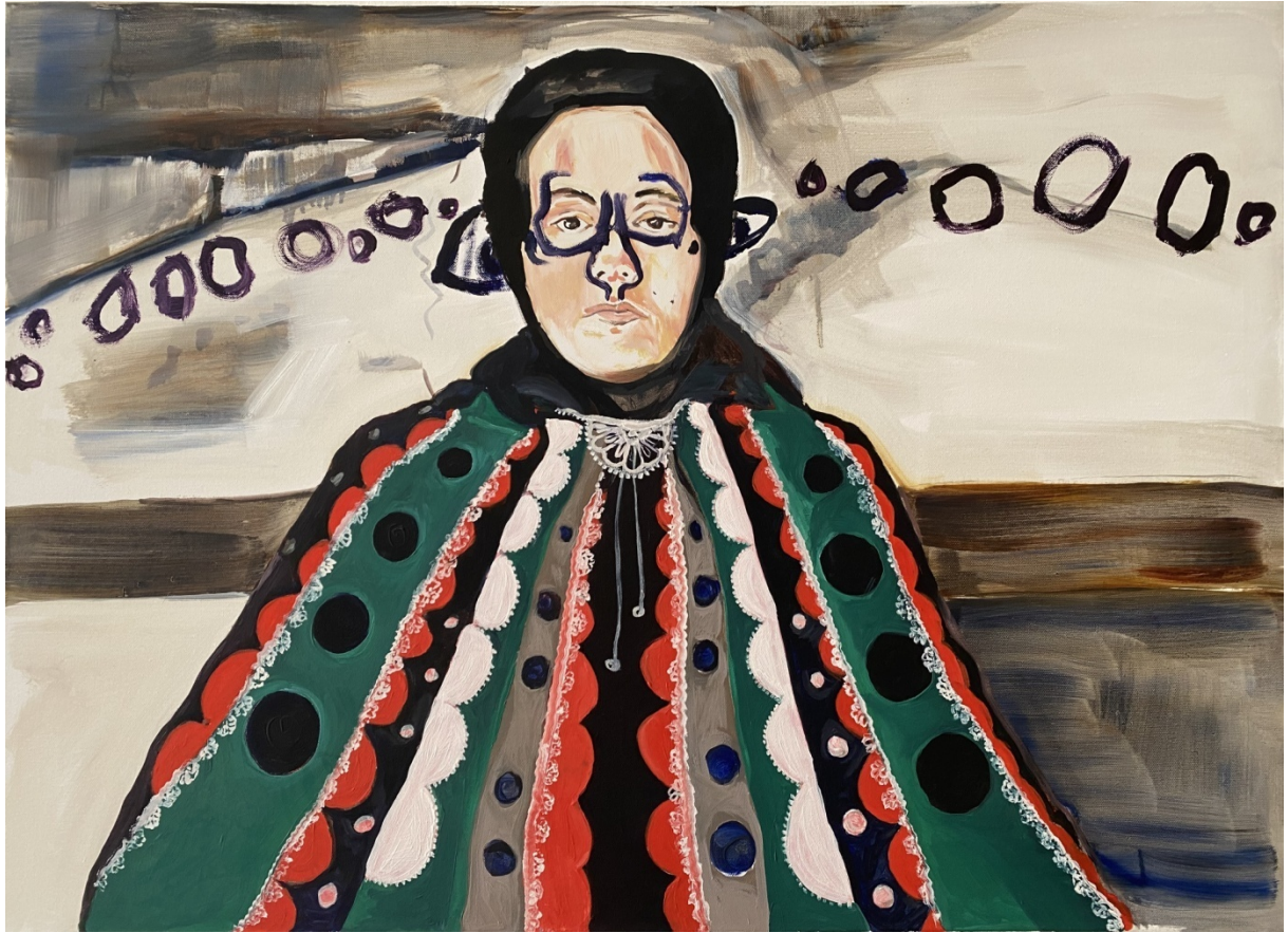
sushimama, 60 x 90