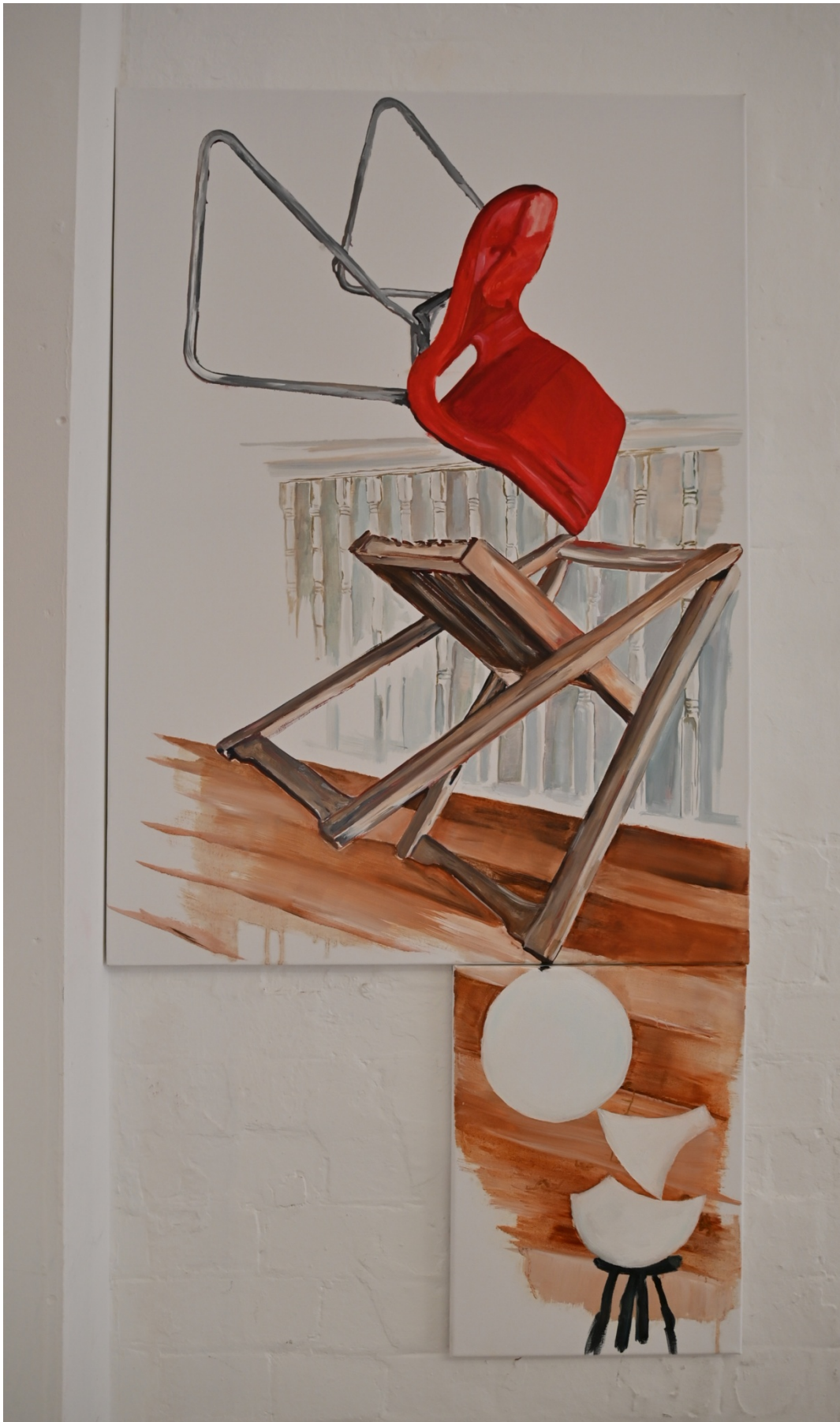
untitled (dyptic), 90 x 60, 40 x 30