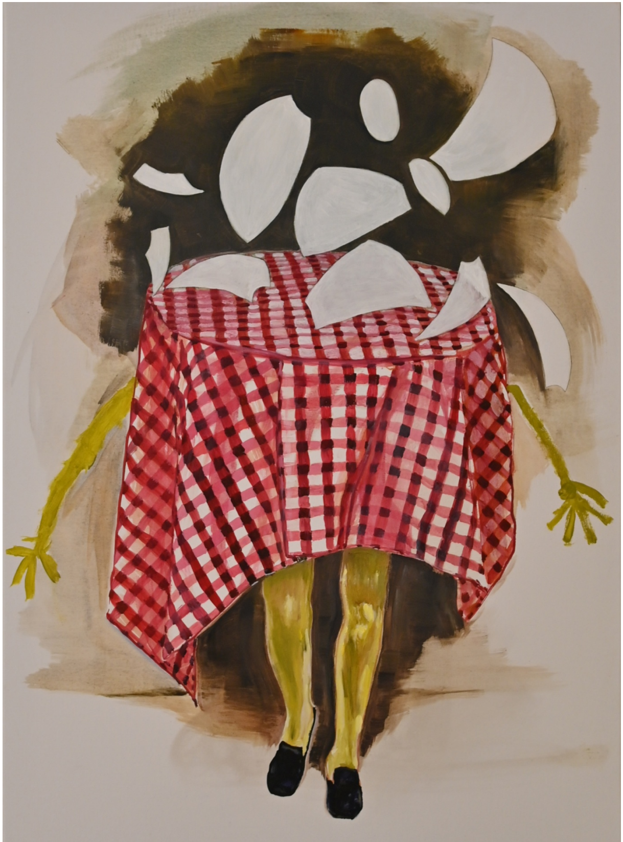
table 1, 90 x 60