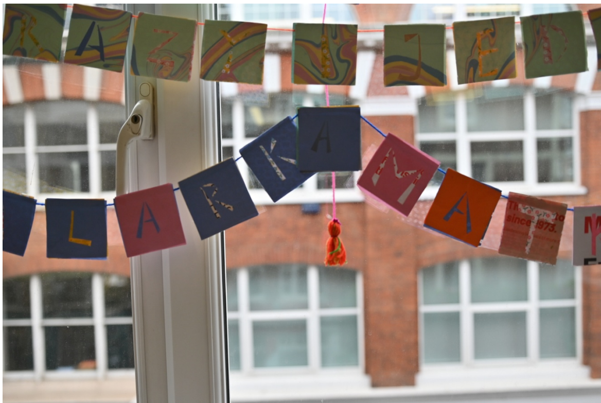
manifesto, site specyfic