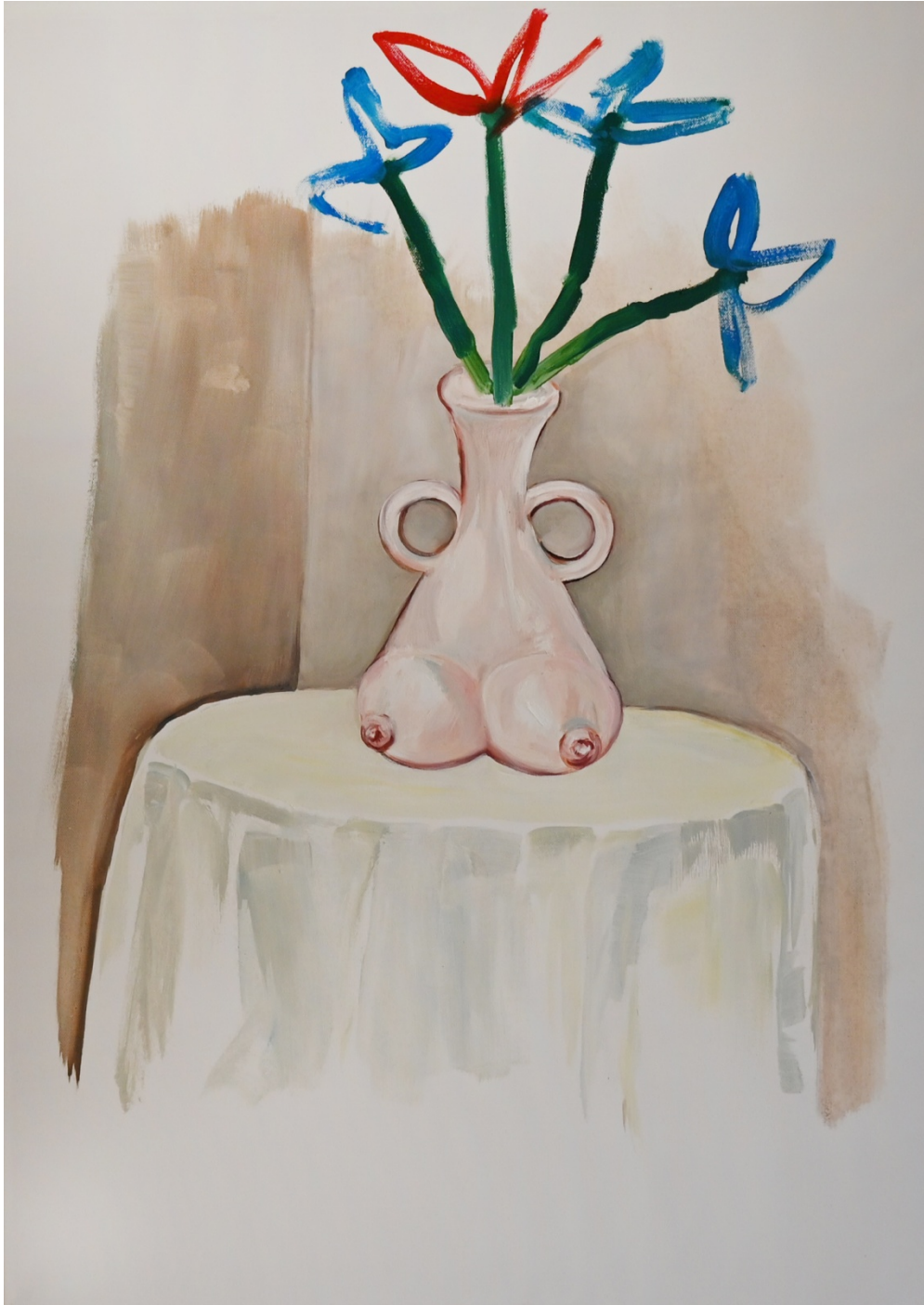
table 2, 90 x 60